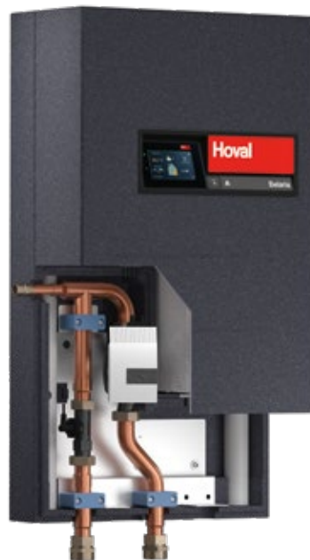
Belaria® pro (24)