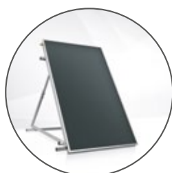
Hoval solar plants