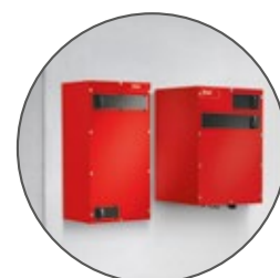
Hoval comfort ventilation