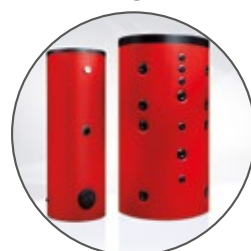
Hoval storage tanks