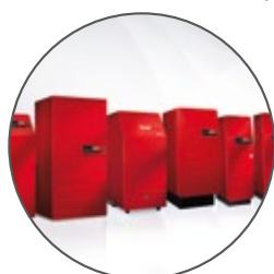
Hoval heat generators

This solution ensures you are provided with standardised operation and matching modules.