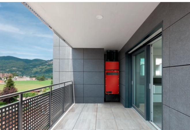
The HomeVent® comfort ventilation units can be installed flexibly, e.g. also outdoors on the balcony.

With the controller, you do not only operate your HomeVent® comfort ventilation, but also your Hoval heating or hot water preparation.