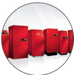
Hoval heat generators

Hoval supplies all components for an efficient heating and room air system. The Hoval TopTronic® E system controller combines all components into an efficient overall system. This solution ensures you are provided with standardised operation and matching components.